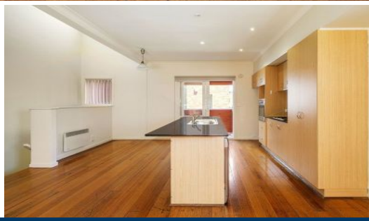
19 Rope Walk BRUNSWICK VIC