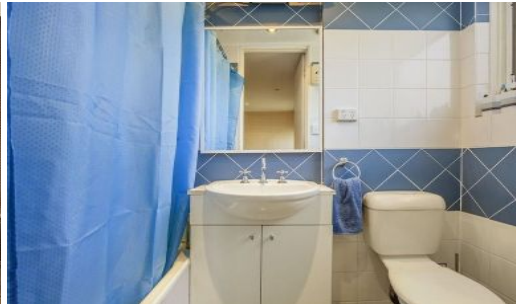
11/49 Dennis Street NORTHCOTE VIC