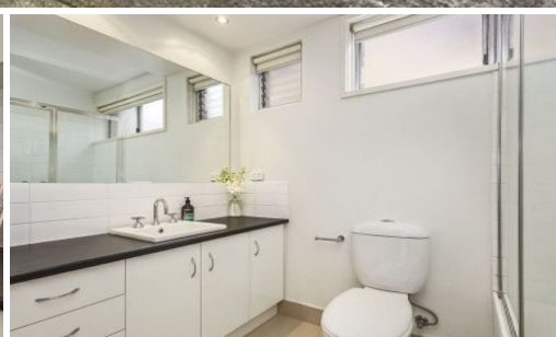
5/11 Kemp Street THORNBURY VIC