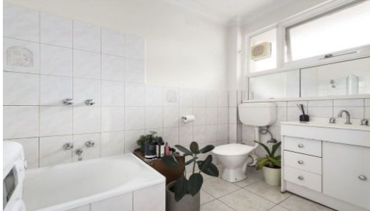
7/28 Ross Street NORTHCOTE VIC