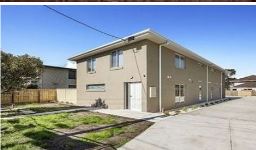
8/233 Rathmines Street Fairfield VIC