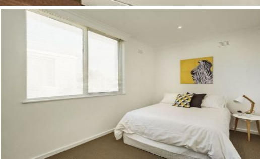
5/48 Woolton Avenue Thornbury VIC