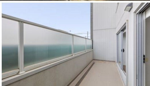
3/239 St Georges Road Northcote VIC